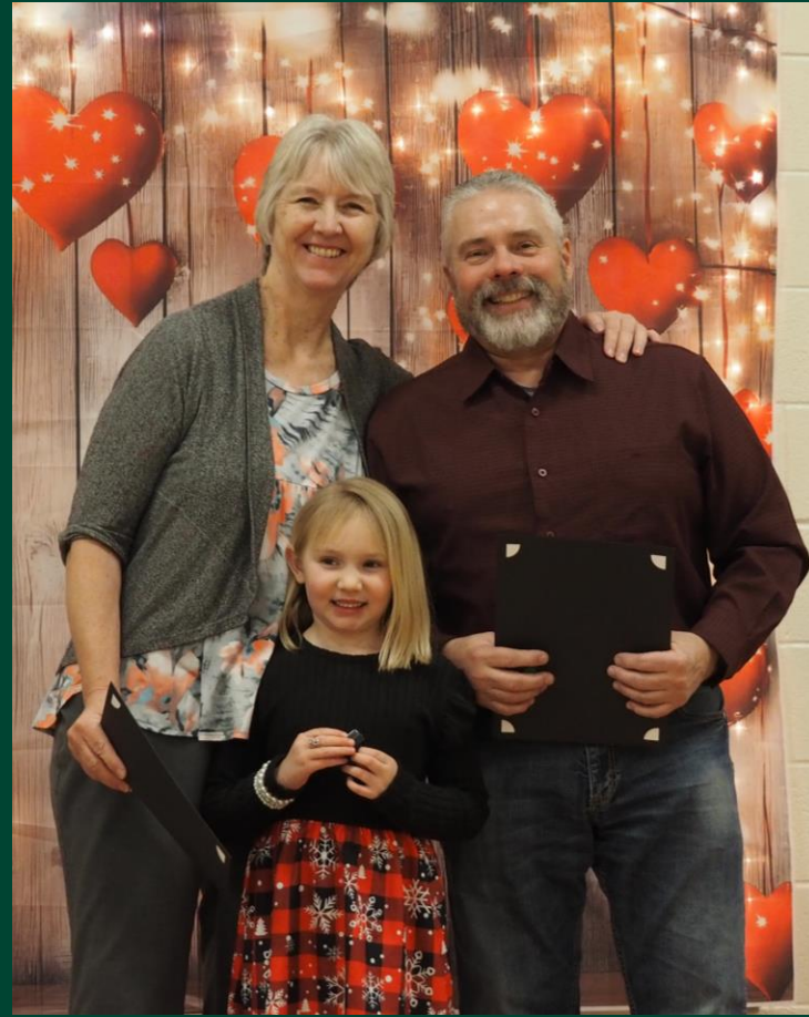
25 Year Leaders