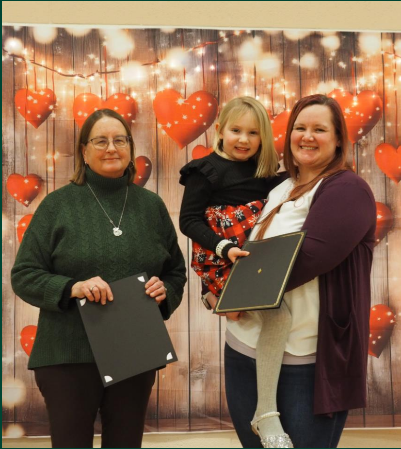
15 Year Leaders