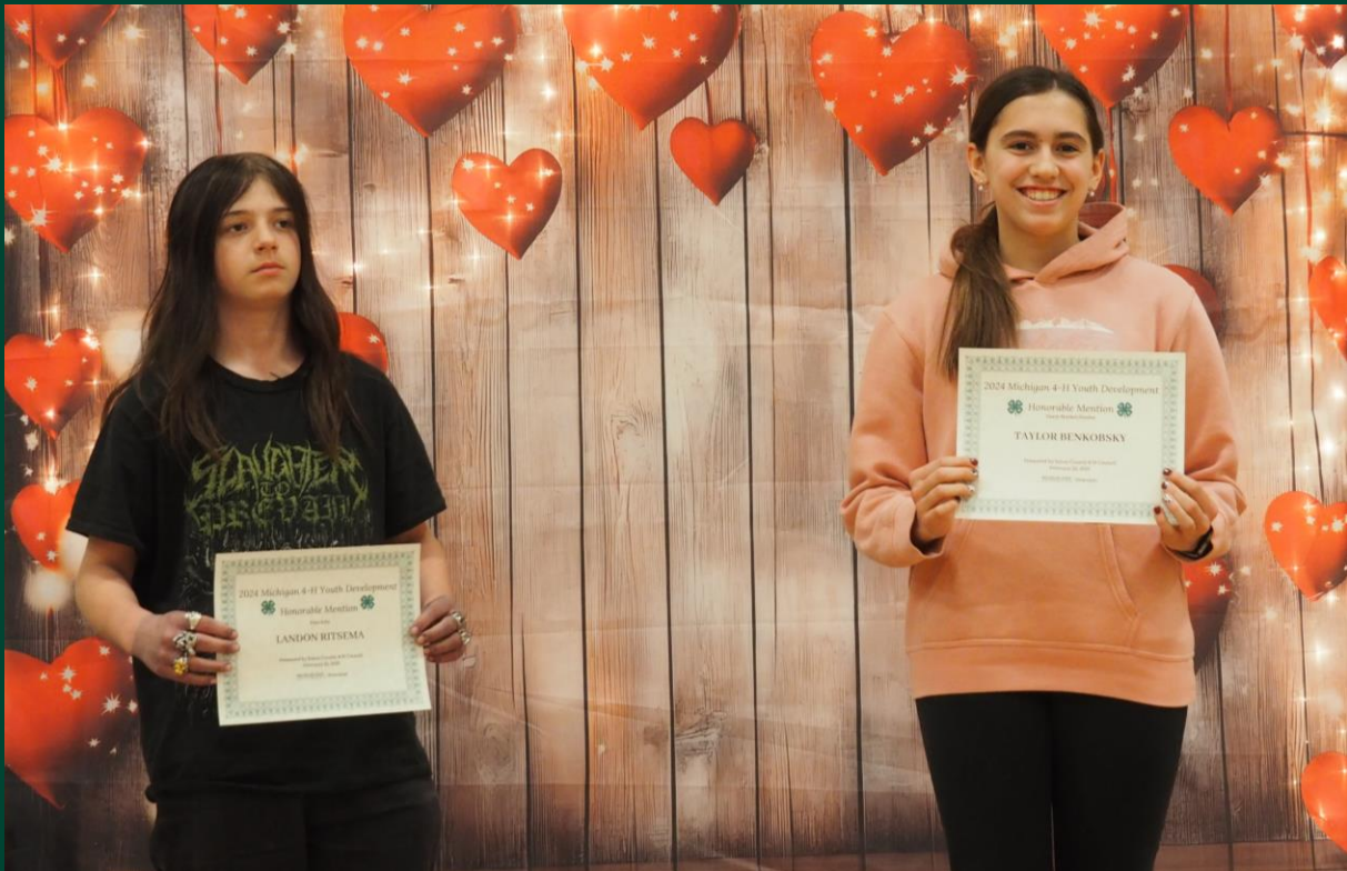
County Medal Award Recipients