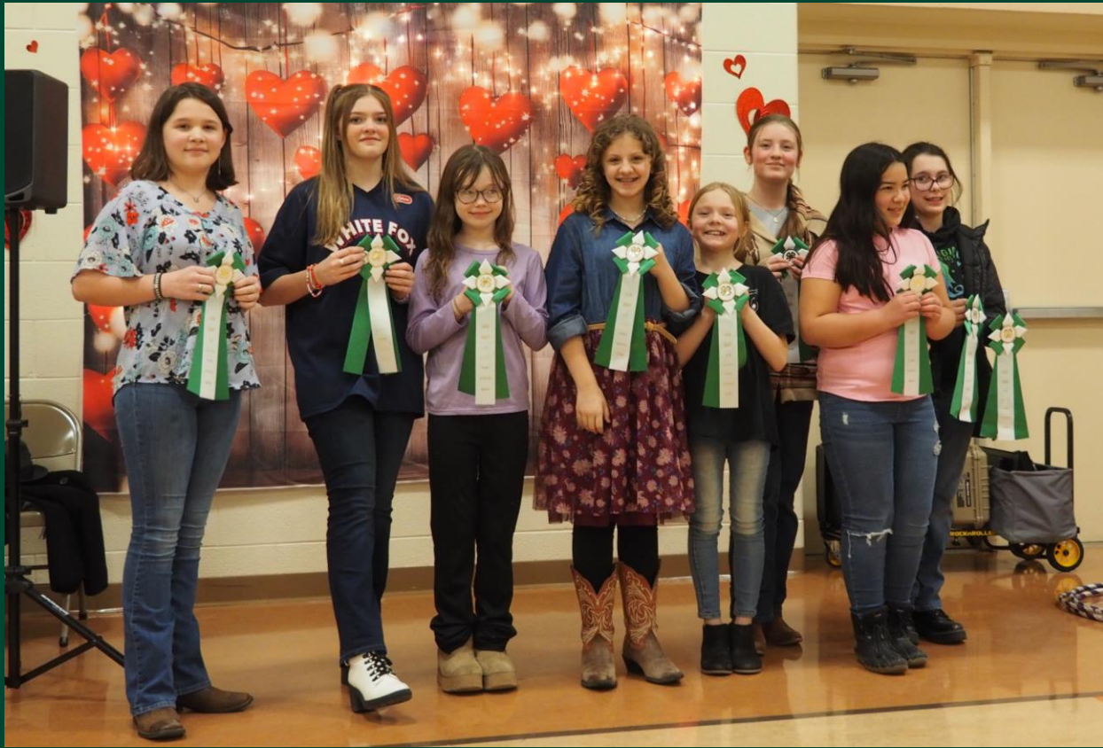
Young Achiever Award Recipients