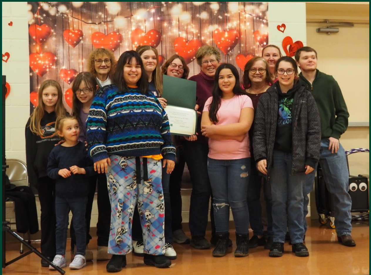
Club Award Winners: Barn Busters 4-H Club